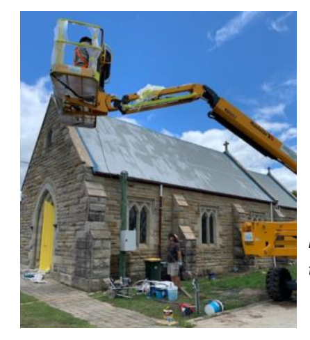
MMM TAS team at work.